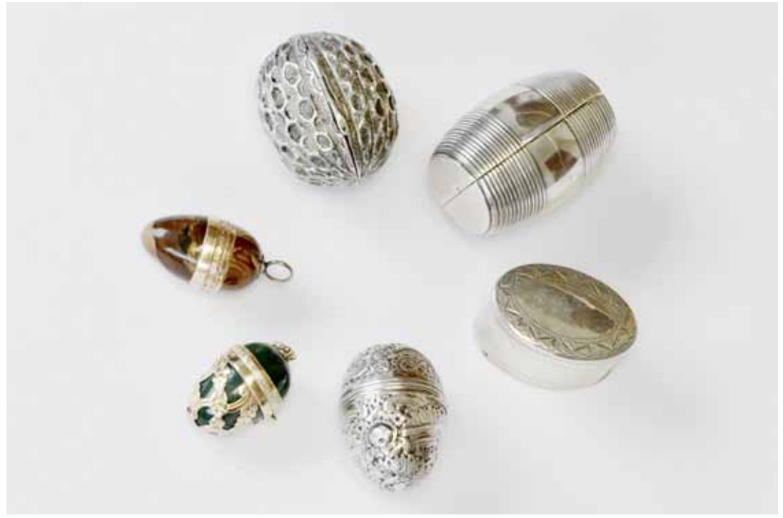
64, 65, 69, 62, 70