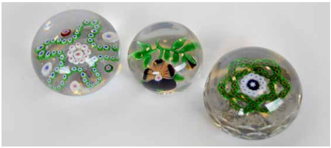
757, 758, 759