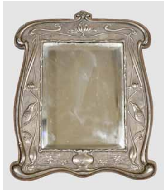
142. A large Art Nouveau dressing table mirror decorated with Kingfishers and textured body. Vacant cartouche and oak panelled back. Chester 1905. By WN. Approx. 31cms high. Est. £250-£300