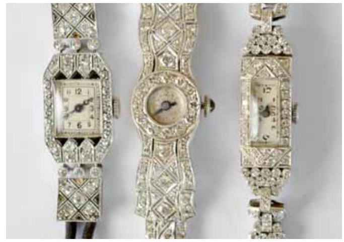
447, 449, 448