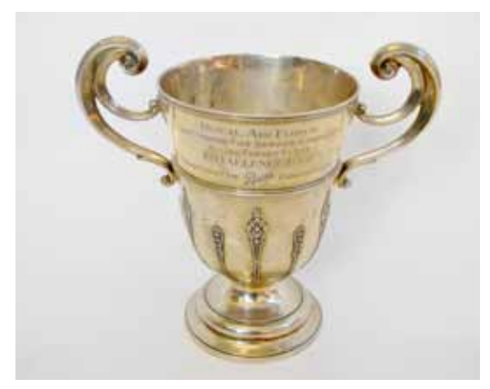
137. A good quality two handled trophy cup with reeded sides on pedestal base. Inscribed "Royal Air Force Challenge Cup". Approx. 1172 grams. Est. £280-£320