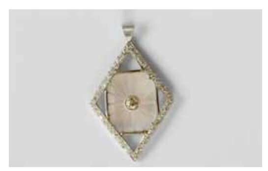
357. A good quality ruby and enamelled necklace set in high carat gold with ring clasp. Est. £1000-£1200