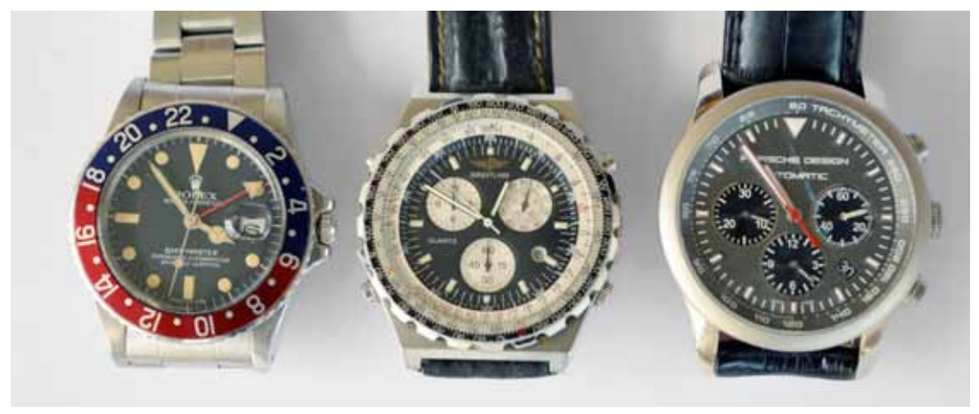
411, 410, 422