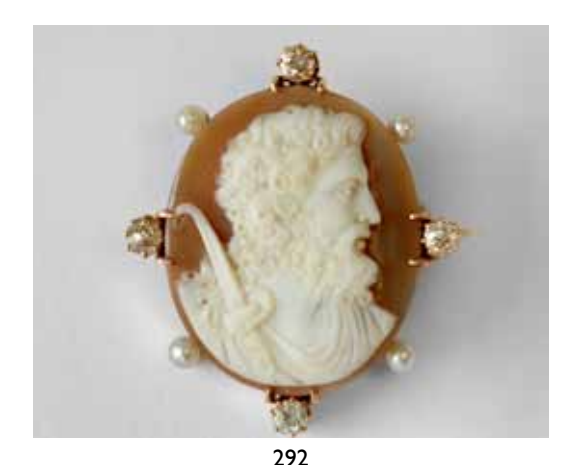
292. An attractive oval shell cameo of a gent with locket back, diamond and pearl border in gold claw mount. Est. £450-£500