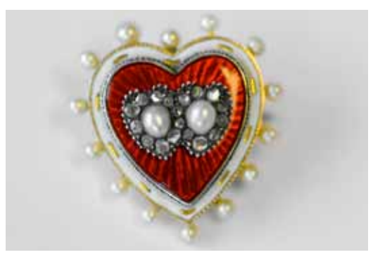
356. An attractive heart shaped brooch with rose diamond and pearl centre on gold back. Est. £800-£900