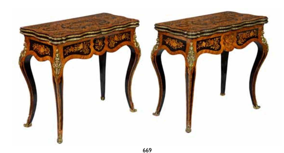
669. A pair of late 19th Century French card tables attractively inlaid with flowers and birds surrounding central musical motif, brass border, ormolu mounts and beading. Est. £6500-£7000