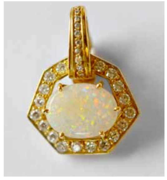
362. A hexagonal opal and diamond drop pendant with loop top in 18ct. Est. £300-£400