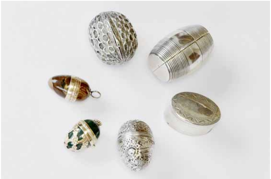
64, 65, 69, 62, 70

63. A small nutmeg grater with fitted interior, domed top and baluster base. Chester. By S&FS. Est. £150-£180