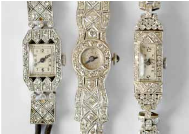
447, 449, 448

425. An attractive heavy 18ct repeating pocket watch with gilt dial. By Rundell Ridge of London. Est. £2200-£2500