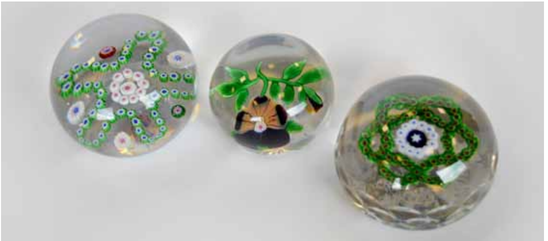
757, 758, 759

760. A small brass bound camphor wood trunk. Est. £40-£50