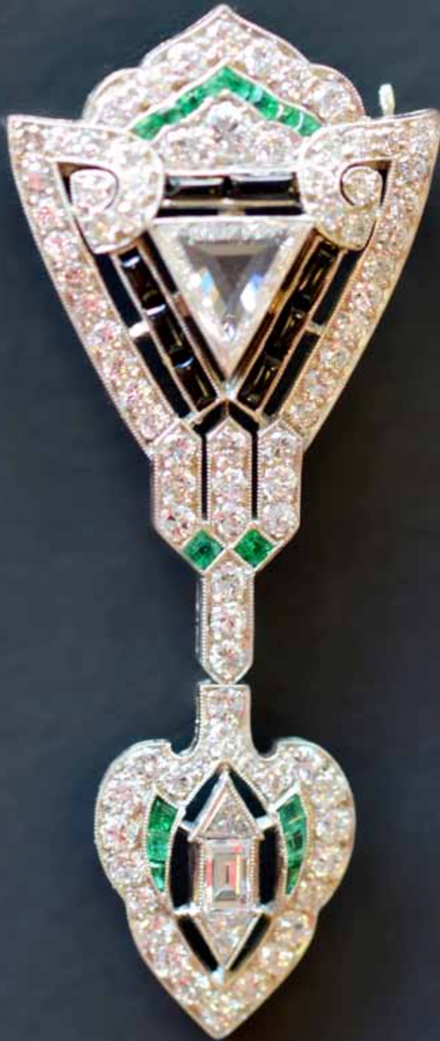
392. An important Art Deco diamond, emerald and black onyx brooch / pendant centred with a triangular diamond with black onyx border, millegrain set with graduated diamonds and calibre cut emeralds suspending a further diamond and emerald section in platinum. Est. £6500-£7000