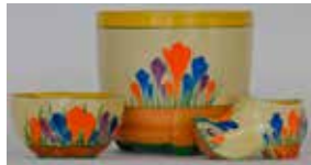
448, 449 & 450