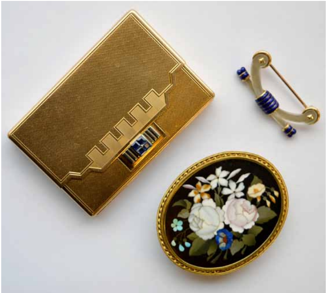
262, 258 & 277