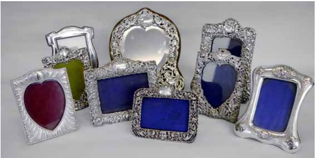
A private collection of good quality picture frames (lots 45-57)

45. A good embossed heart shaped picture frame decorated with scrolls and cherubs. London. By WC. Approx. 19 cms high. Est. £200-£250