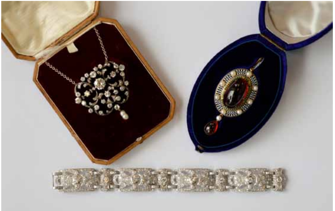
347, 349 &amp; 344

337. A heavy platinum wedding band of textured design with fan shaped edges and carved centre. Approx. 7.6 grams. Est. £170-£200