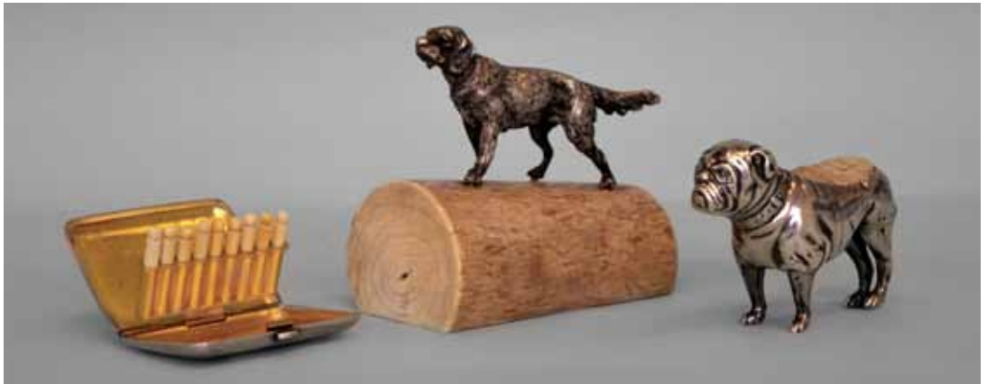
89, 151 &amp; 88