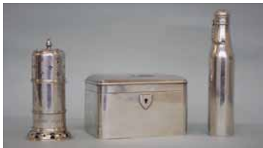
181, 178 & 177

177. A large good quality scent bottle with screw on cover and suspension chain. London 1927. By VVS. Approx. 17 cms. Est. £250-£300