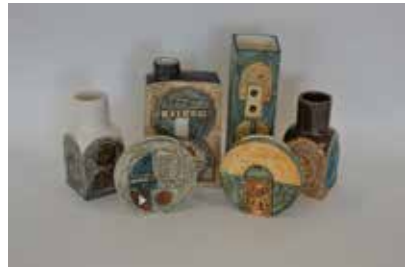
460M, N, P, Q &amp; R

460L. CLARICE CLIFF: "Fantasque". A large fruit bowl decorated with flowers. Signed to base. (Significant damage). Est. £20 - £30.