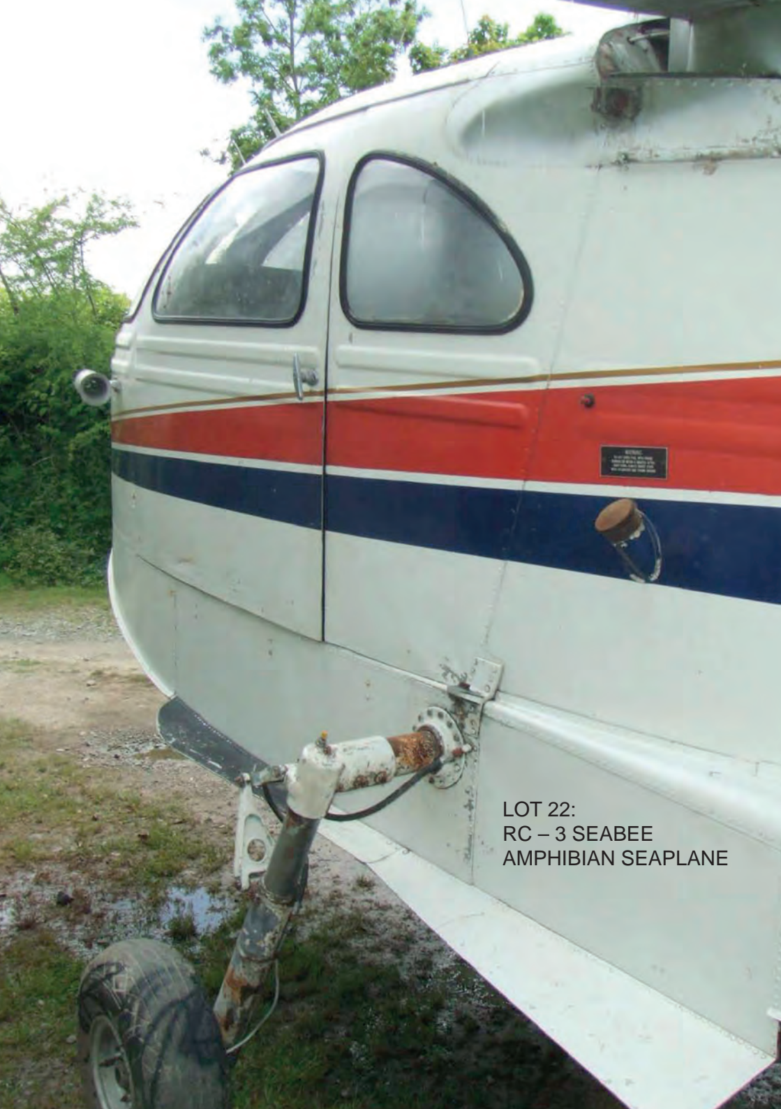
LOT 22: RC - 3 SEABEE AMPHIBIAN SEAPLANE